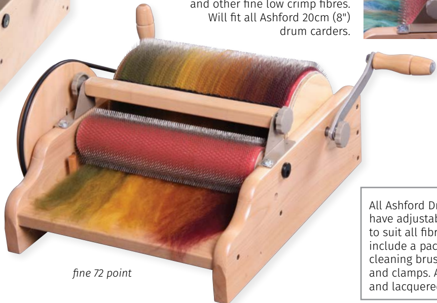
fine 72 point

6:1 for smooth, controlled carding of fleeces.