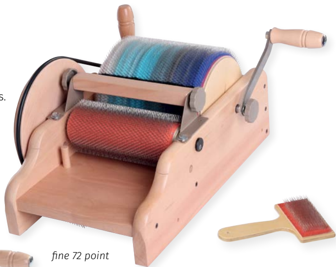
fine 72 point

6:1 for smooth, controlled carding of fleeces.