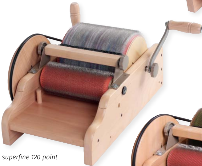
superfine 120 point